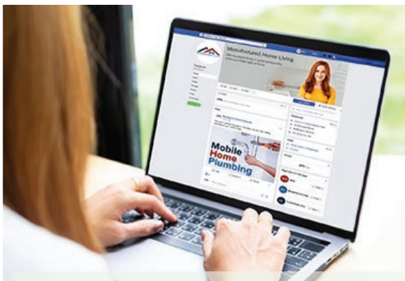
Do you want to continue receiving updates about our community? Follow us on Facebook to stay informed about the latest news! We will be posting articles, upcoming events, specials, and other community information.